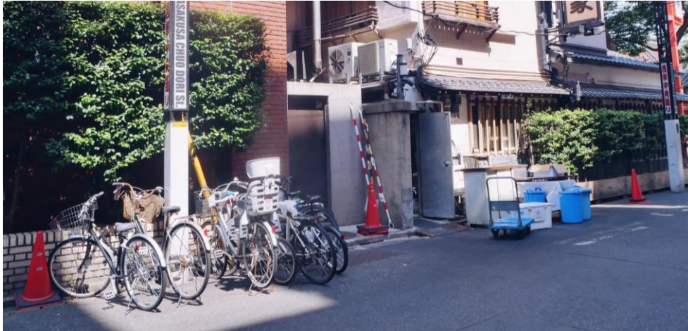
Bicycle is one of the popular transportation in Japan. Everywhere has a road for bicycle.