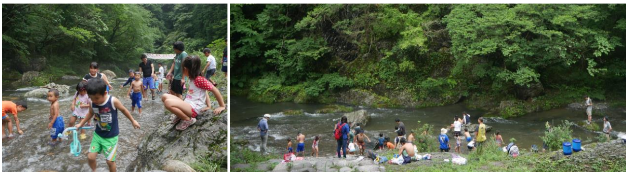
In weekend or holiday is a family day.