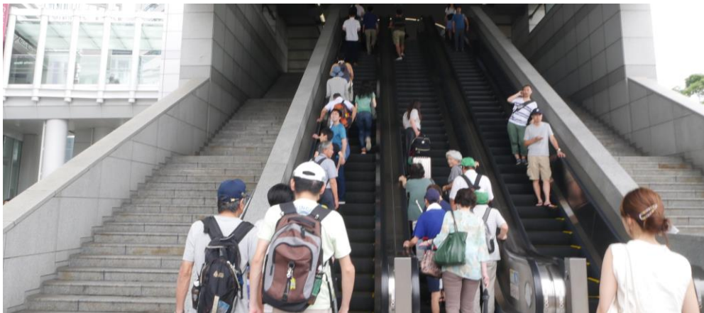
Japanese is well known of a good discipline, example they always stand on the left hand side of the escalators and other side is for the hurry route.