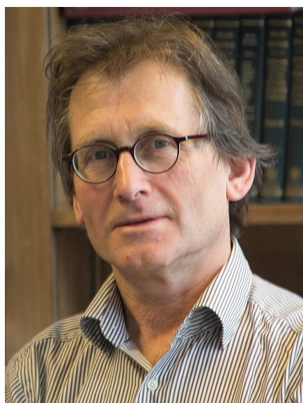
2016 Nobel Laureate in Chemistry Prof. Dr. Bernard L. Feringa University of Groningen The Netherlands