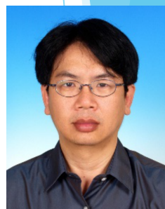
Professor Jing-Cherng Tsai

Lactic acid-based chiral block copolymers: Syntheses and molecular self-assembly