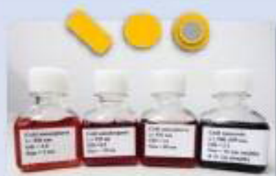
GOLD NANOPARTICLES FOR BIOMEDICAL APPLICATIONS