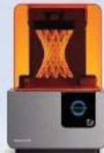
SYSTEM FOR 3D PRINTING