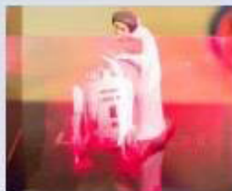
HOLOGRAM FOR PHOTOPOLYMER