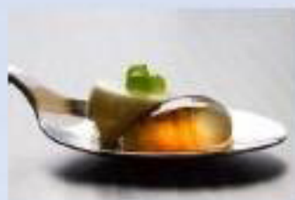
MOLECULAR GASTRONOMY AND COLOR HYDROGEL