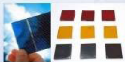
SOLAR CELLS AND NANOSCALE ANALYSIS